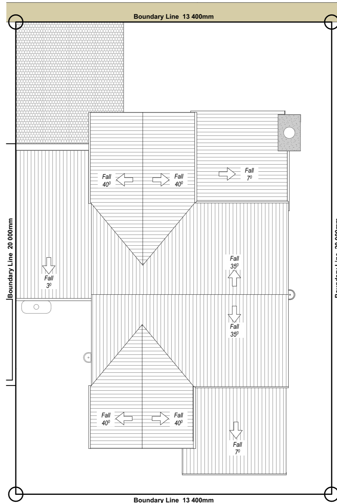
1.1 Roof Plan - (C1) 1:100

Unit Type Type C1 Bedroom 2 Bathroom 2 Dressing Area 1 Garage 1