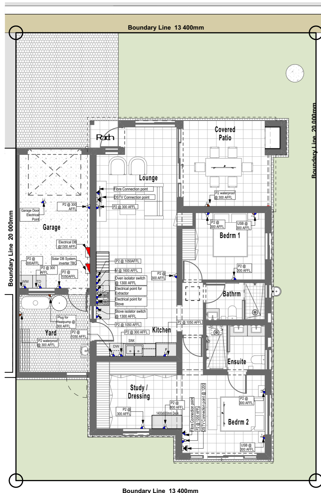
1.2 Electrical Plug Layout - (C1) 1:100