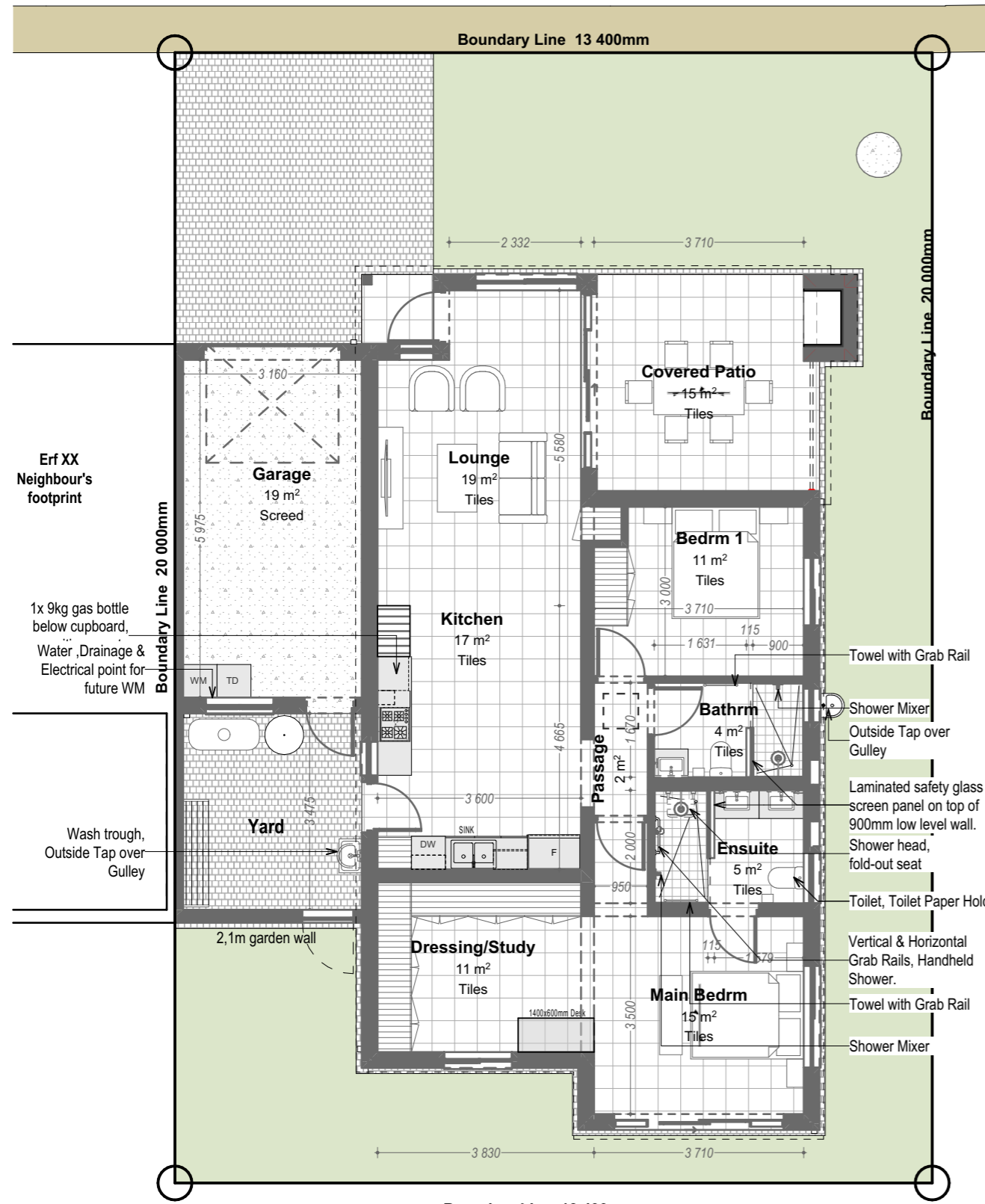
1.1 Ground Floor Plan - (C1) 1:100